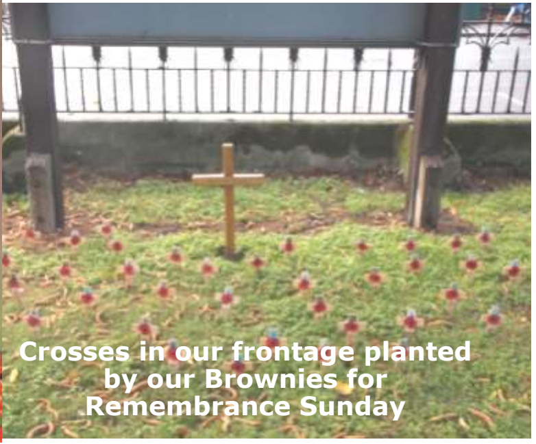
Crosses in our frontage planted by our Brownies for Remembrance Sunday